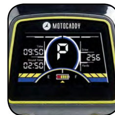
Fig 2 - M3 PRO DHC