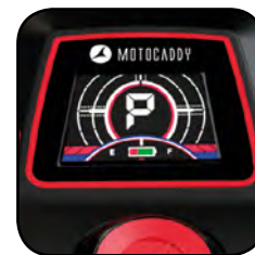
Fig 1 - M1 DHC

To release the parking brake, press the on/off button to start the trolley.